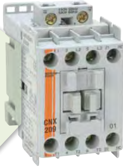
CNX-209-120 Special Purpose contactor