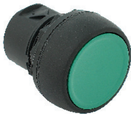
D7P – Plastic housing with a black plastic captive bezel.

Front elements, including pushbuttons, mushroom operators and selector switches, are IP 66 protection against submersion, oil and dirt, making them reliable in the toughest industrial environments. Metal operators are Type 4/13 and plastic operators are Type 4/4X/13.