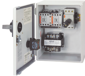
Painted Steel, Type 4 / 12 Enclosure