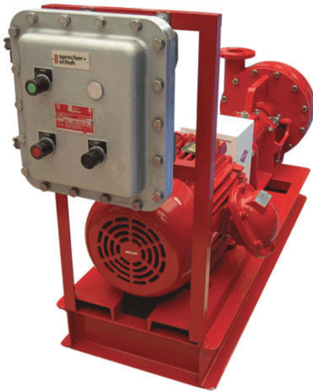
Explosion Proof motor control panel mounted directly to motor and pump frame.

Sprecher + Schuh offers explosion-proof starters for environments covered by the following classifications: